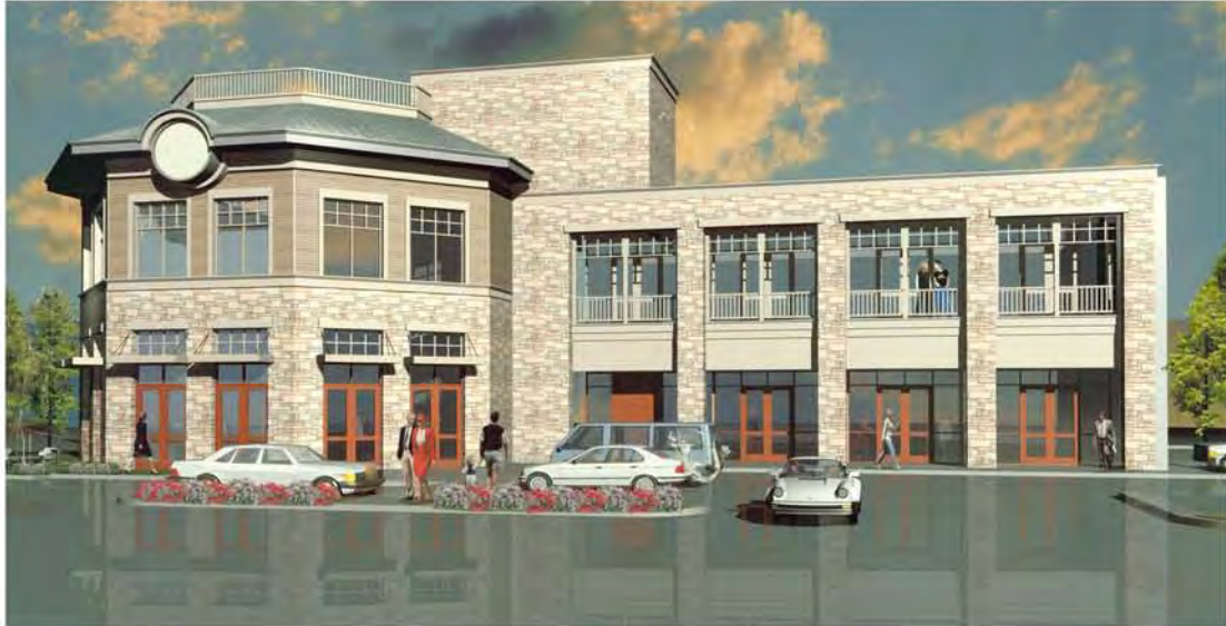
North Elevation @ 11th Street