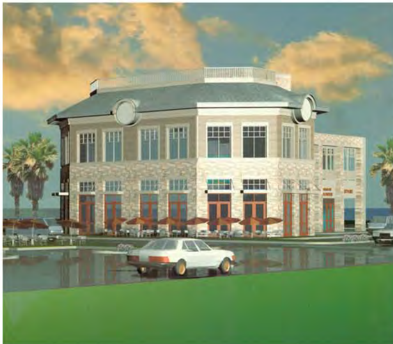
North East Elevation Beverly Street @ 11th Street